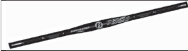
Figure 1 Bontrager Race XXX Lite handlebar