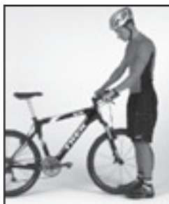
Figure 2 Function test the handlebar and stem

As with anything mechanical, every part of a bicycle has a limited useful life due to wear, stress, and fatigue. Fatigue refers to a low-stress force that, when repeated over a large number of cycles, can cause a material to fail or break. The length of the life of a part varies according to its design, materials, use, and maintenance. Although lighter parts may, in some cases, have a longer life than heavier ones, it should be expected that light weight, high performance parts require better care and more frequent inspections.